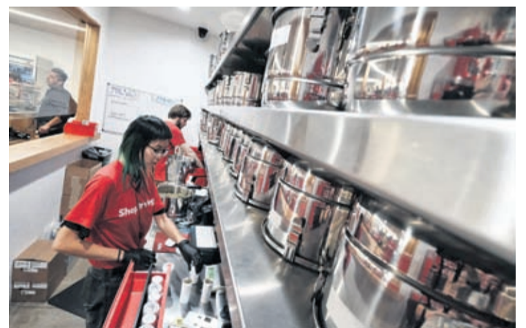
In this Jan. 12, 2018, file photo, a bud tender prepares marijuana for a customer at Med Men a dispensary in West Hollywood, Calif.

Companies, executives and groups signing the letter included the California Cannabis Industry Association, the California arm of the National Organization